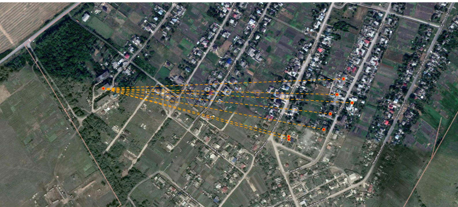
A map of LigoDLB 6-90ac AP and 7× 6-15ac CPE links.

The network owner did not replace the LigoDLB CPE as all LigoWave 5GHz devices can work over frequencies up to 6.1GHz.